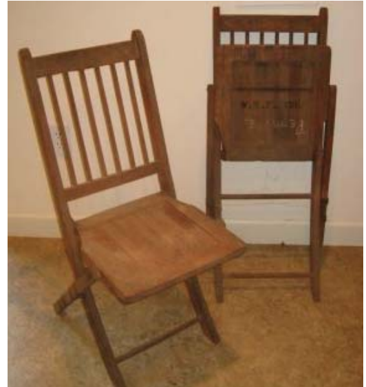
Four wooden folding chairs. The bottoms of the chairs are labeled "W. T. F CO. Penrose" (Warrington Township Fire Company)