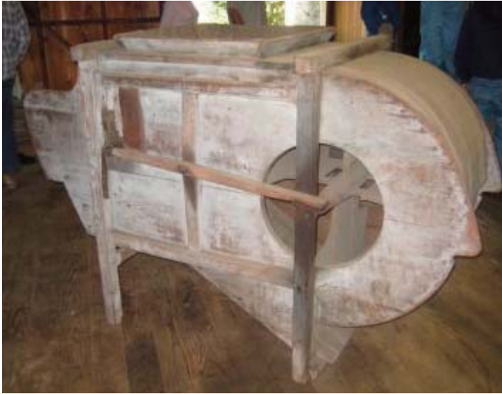
GRAIN CLEANER - All wood and assembled with wooden dowels. Similar samples found online date it from the 1870s to the 1900s. (This is big... 3 feet by 4 feet by 4 feet)

We were able to purchase some Warrington historical items at the recent auction held at the Penrose Property. Several are shown here. We hope to eventually house these at the Folly Road Schoolhouse.